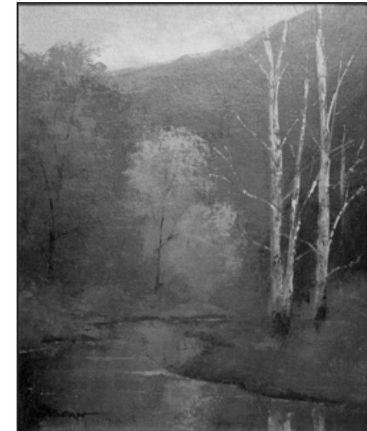
Artwork by Phil Bean, 2008 Featured Artist

Entry Deadline September 15, 2008 12:00 noon See delivery dates inside